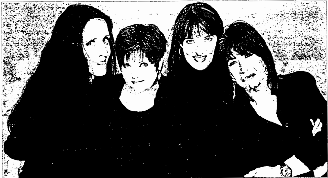
Harmonies, humor and plenty of attitude will fill the Jim Rouse Theatre in Columbia when the Four Bitchin' Babes arrive and hit the stage.